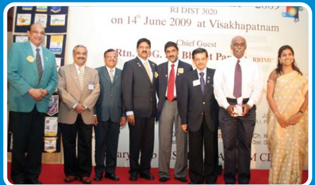
At the District Assembly