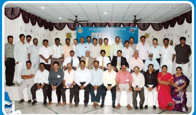
PETS & SETS