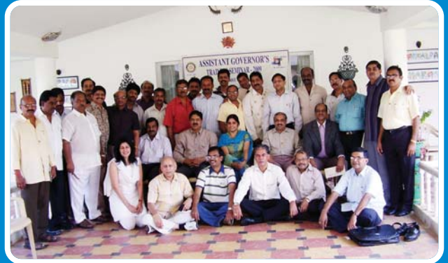
Asst. Governor's Training