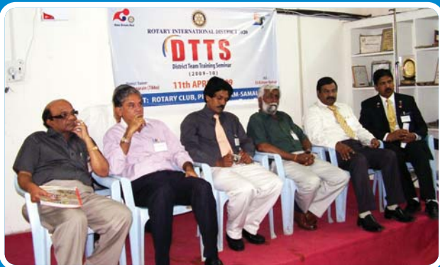
District Team Training Seminar